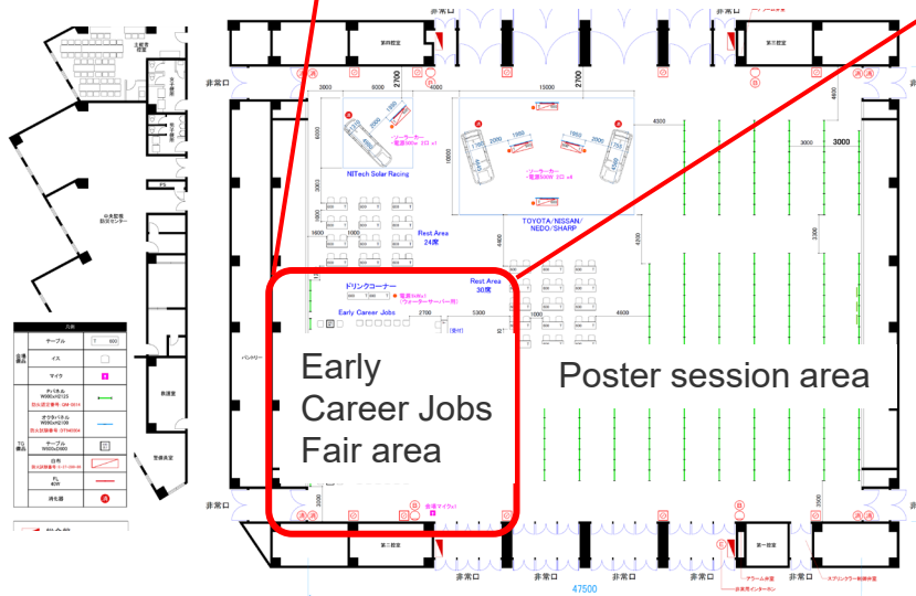
Overall plan view of the Event Hall